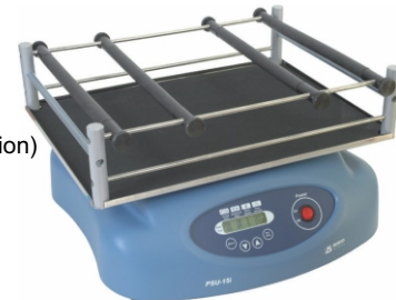
PSU-15i WITH PLATFORM UP-330